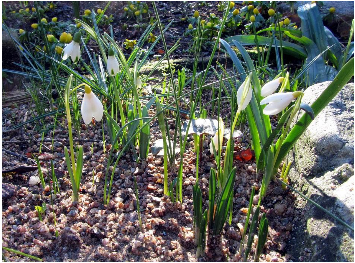
I have some of the smaller Galanthus growing well (and unlabelled) in sand beds, like these yellow ones that can dwindle away in other garden bed. Like many other bulbs they grow well in the sand and it is easy to lift and split them every year.

the forum where the' Drop fiends' are listing <u>Galanthus that are truly easy to recognise</u> but on the other hand there are a lot that are simply not worthy of the name. Am I worried about this? No - anything that gets otherwise sane people on their knees in the mud and snow looking at and enjoying bulbs is OK in my view. Time will be the great 'sorter- outer' as only those truly good and recognisable plants will still be around in ten, twenty, or more years' time.