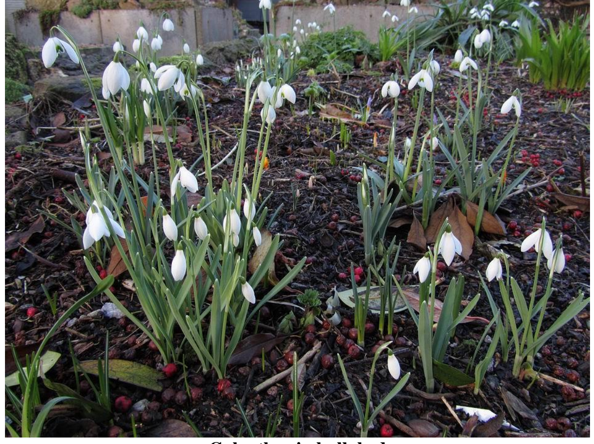
Galanthus in bulb bed