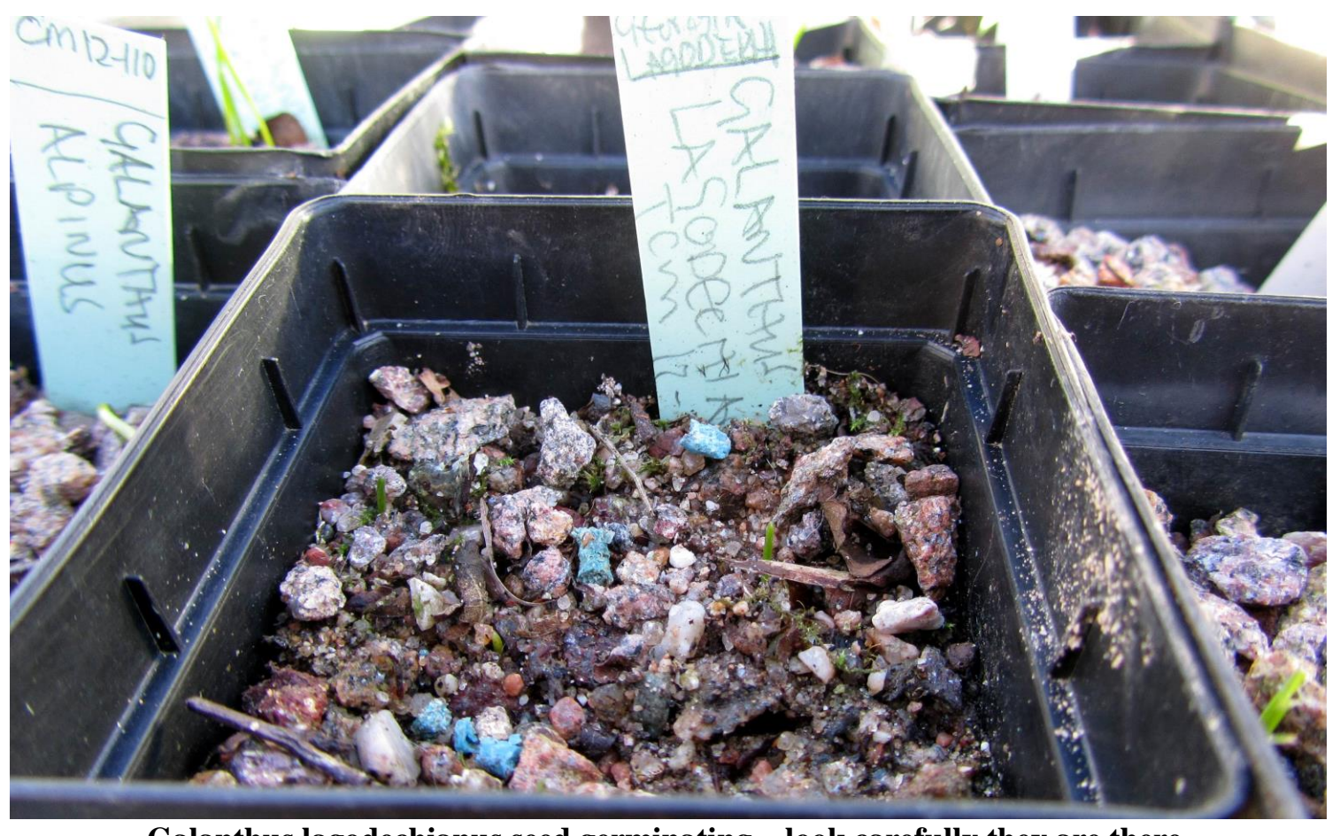
Galanthus lagodechianus seed germinating – look carefully they are there.