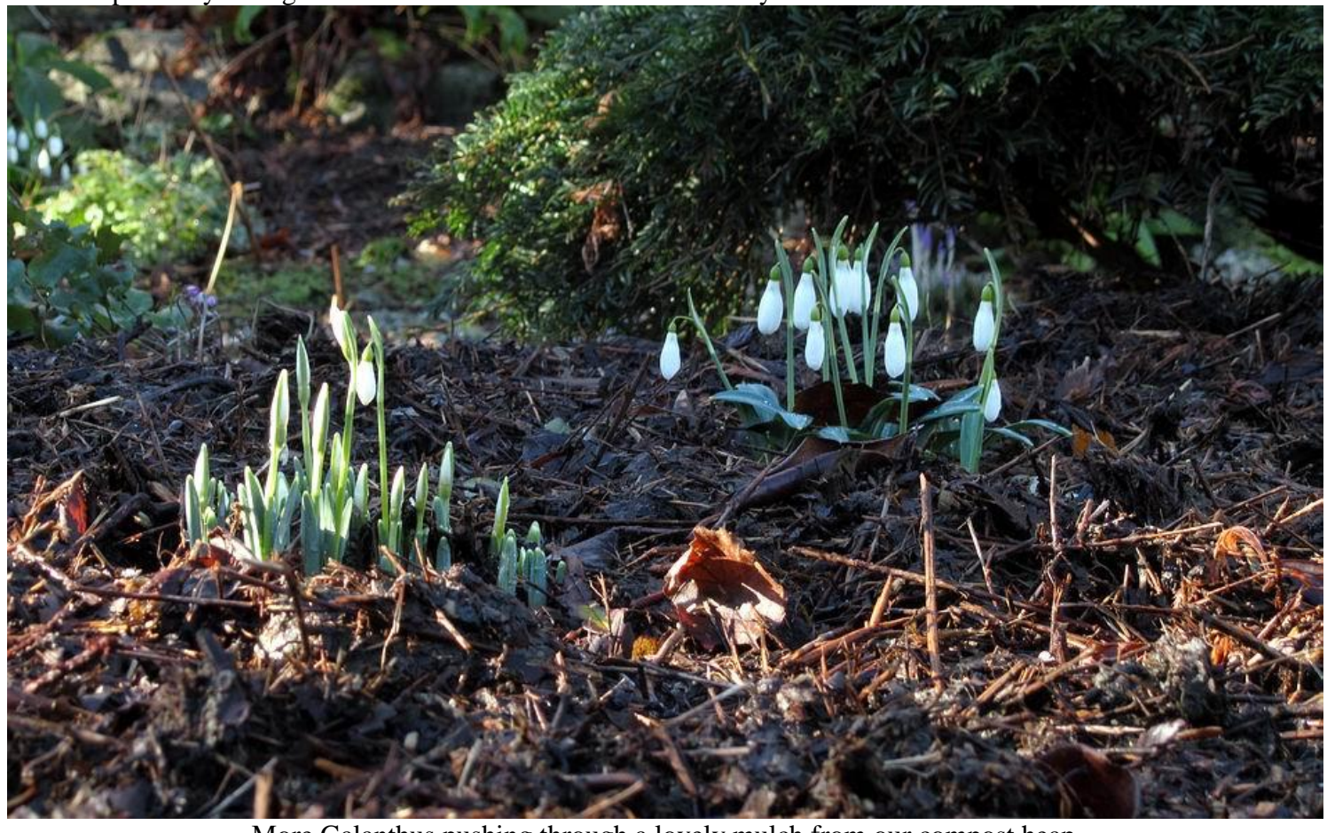
More Galanthus pushing through a lovely mulch from our compost heap.

It is nice that bulbs should increase forming clumps in the garden but I really do not like clumps especially when the flowers cannot display as individuals. Ideally I would like to split all clumps every other year- a task that is simply not possible with the number of bulbs we grow – however I do try and get round as many as I can. I split this clump a few years ago and I reckon it will be fine for another year.