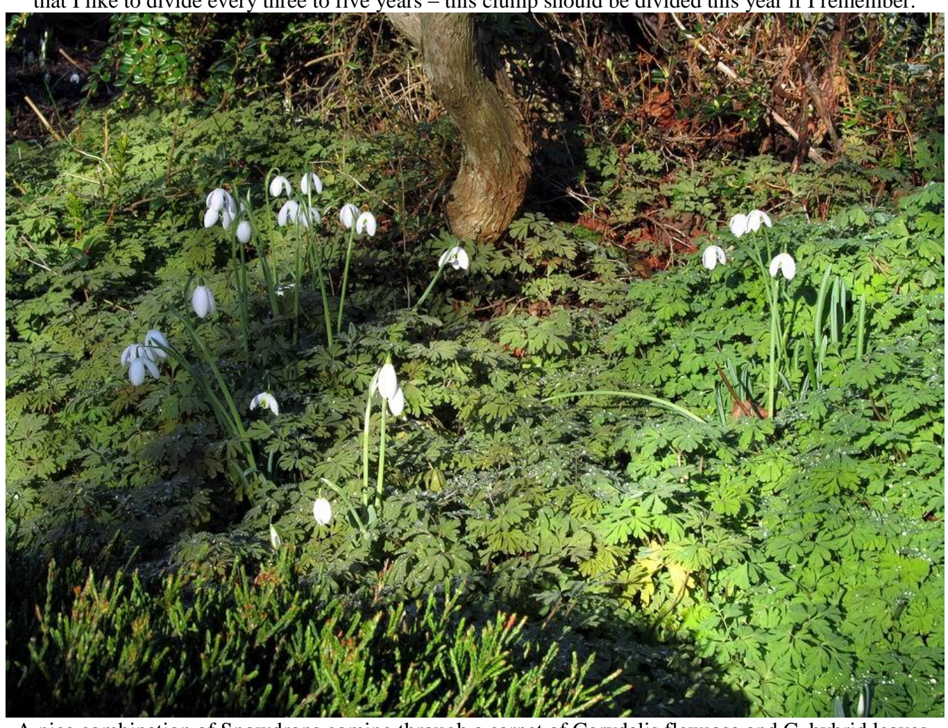
A nice combination of Snowdrops coming through a carpet of Corydalis flexuosa and C. hybrid leaves.

We have grown this form of Crocus sieberi atticus in our garden for years it is one of the best, forming great clumps that I like to divide every three to five years – this clump should be divided this year if I remember.