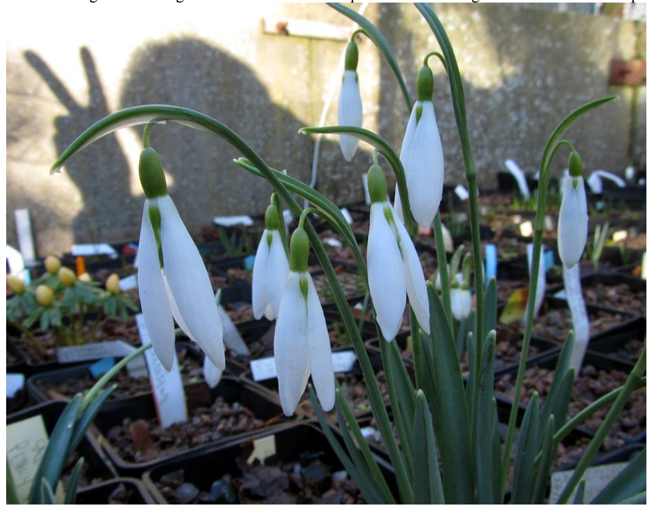
Galanthus 'Wasp' on the other hand emerged some weeks ago and has grown quite tall in our poor light. I would like to point out that I am not the one in this household who is guilty of buying snowdrop bulbs –now, seed on the otherhand..... ©

Galanthus 'Seagull' Galanthus 'Seagull' is among the ones we have still in pots and at this stage it looks nice and compact.