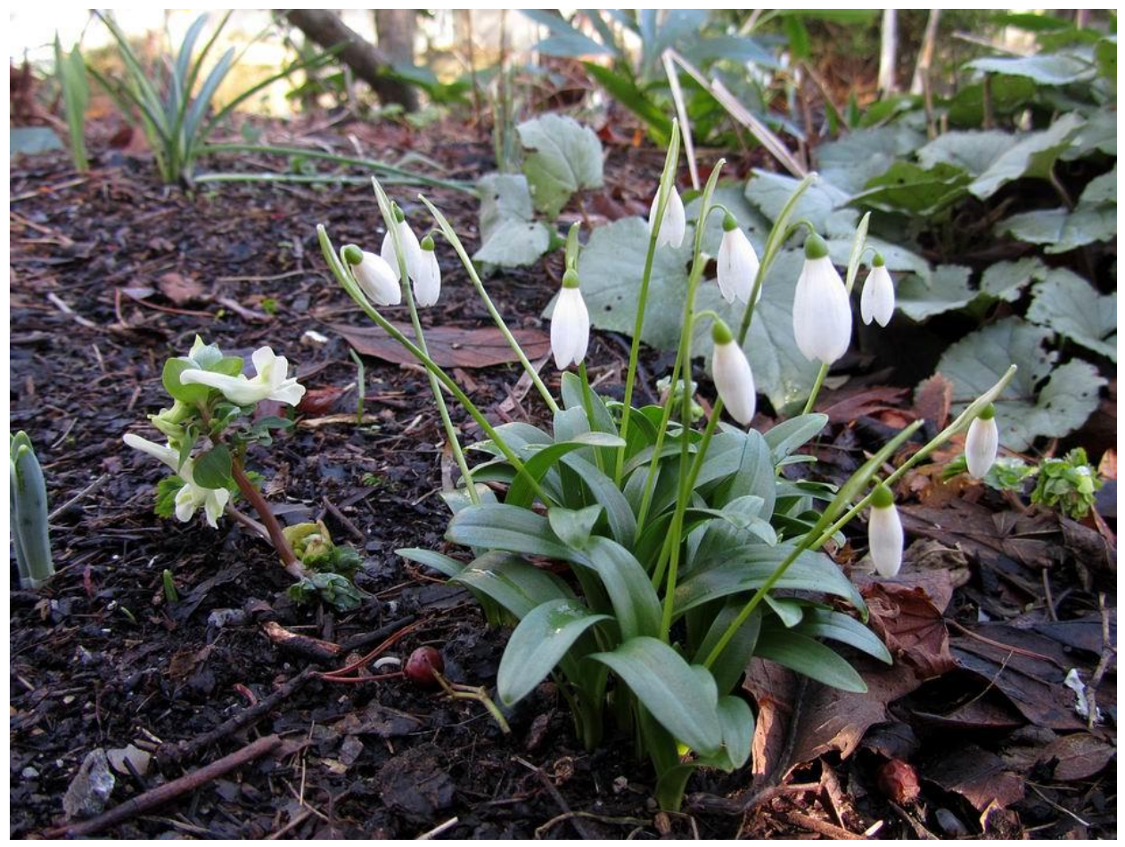
Corydalis malkensis and Galanthus woronowii

We can see the garden really waking up as many bulbs are starting to flower including the first Corydalis malkensis that has self-seeded next to a small clump of Galanthus woronowii.