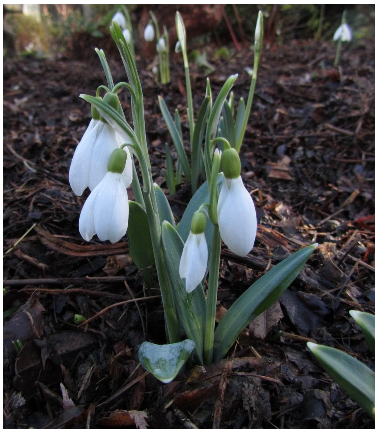
Galanthus 'Craigton Twin'

BULB LOG 07.....12<sup>th</sup> February 2014