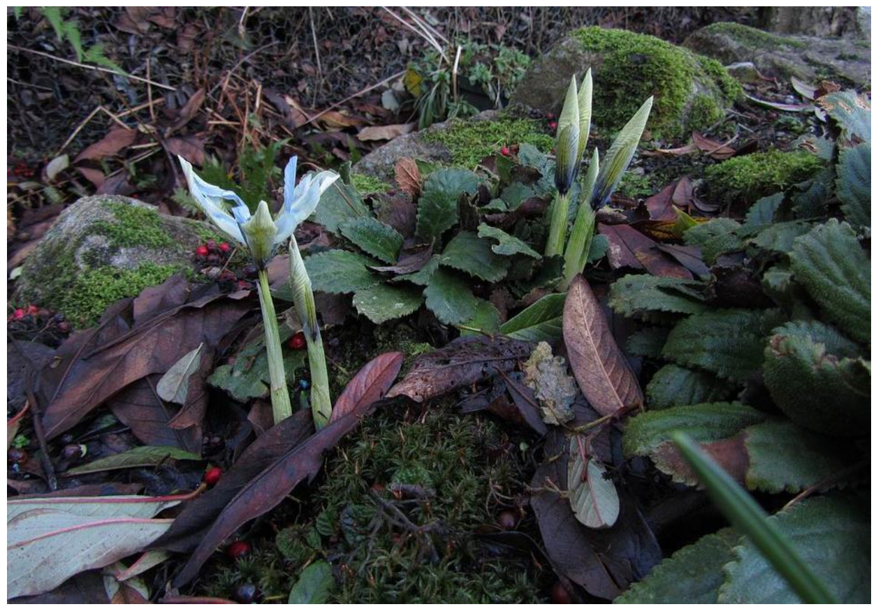
Iris 'Katharine Hodgkin'

A group of Crocus abantensis in a raised bed are just waiting for the temperature to rise enough to trigger them to open. Even when the sun does shine it is still very low in the sky resulting in the Crocuses staying firmly shut. You may have noticed a few blue slug pellets that I have scattered around the Crocus – I would prefer not to use them but the slug population has thrived so much in this moderate winter that without some measure to control them these flowers would be grazed away.