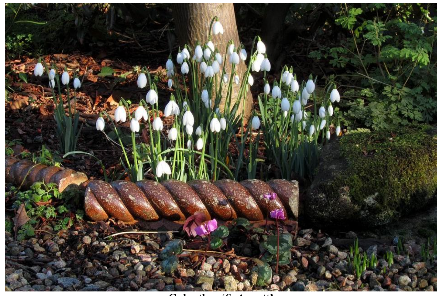
Galanthus 'S. Arnott'

It is nice that bulbs should increase forming clumps in the garden but I really do not like clumps especially when the flowers cannot display as individuals. Ideally I would like to split all clumps every other year- a task that is simply not possible with the number of bulbs we grow – however I do try and get round as many as I can. I split this clump a few years ago and I reckon it will be fine for another year.