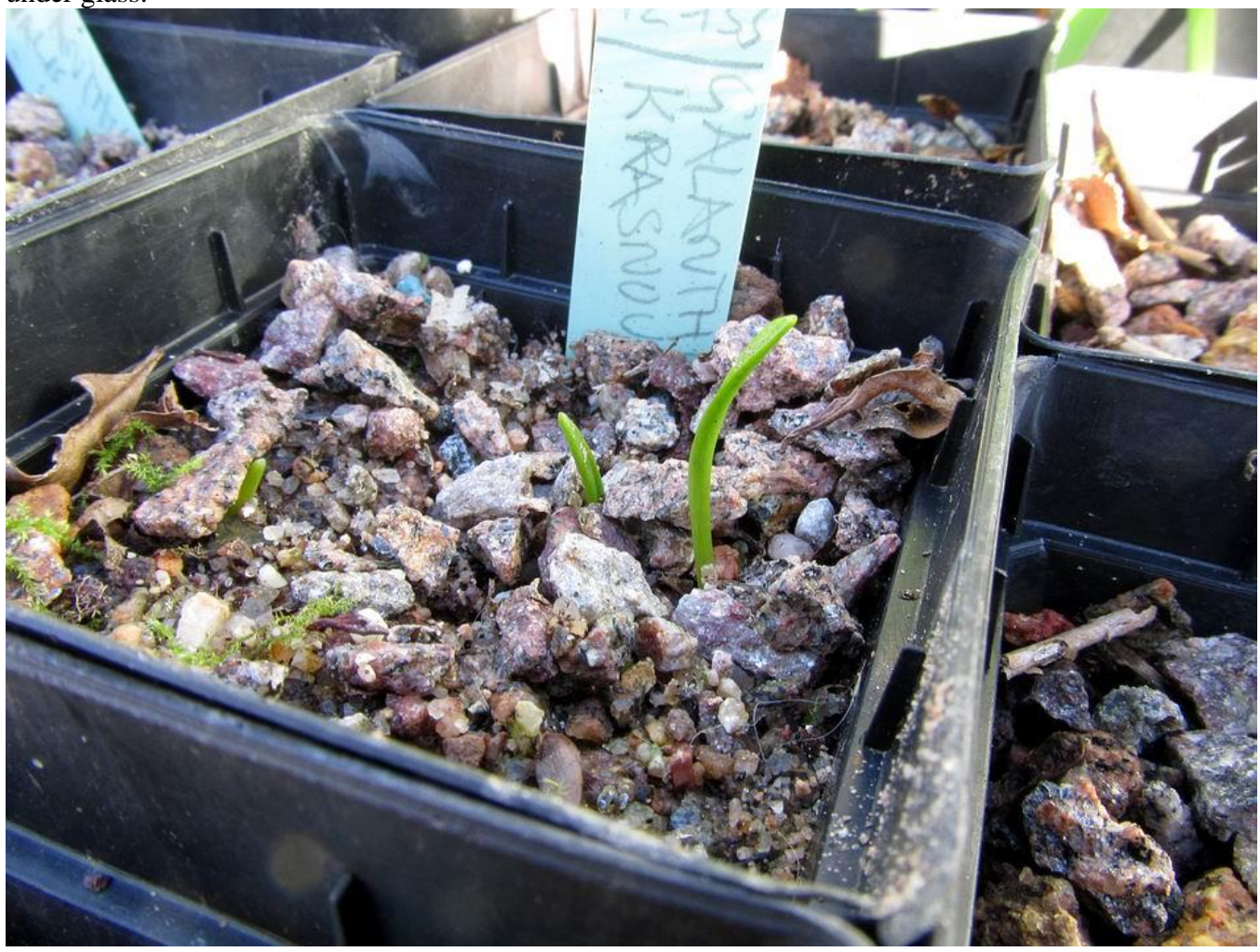
Galanthus krasnovii seed germinating

Last year we got some damp packed Galanthus seeds- it was a bit worrying as many had moulds on the surface-when we got them however I sowed them 3 to 4 cms deep and placed them in the open seed frame. Nothing happened in spring of 2013 but now there is some germination in all the pots. Again I had to apply a few slug pellets as the young seedlings were getting grazed down to the ground as soon as they emerged. I have also moved them under glass.